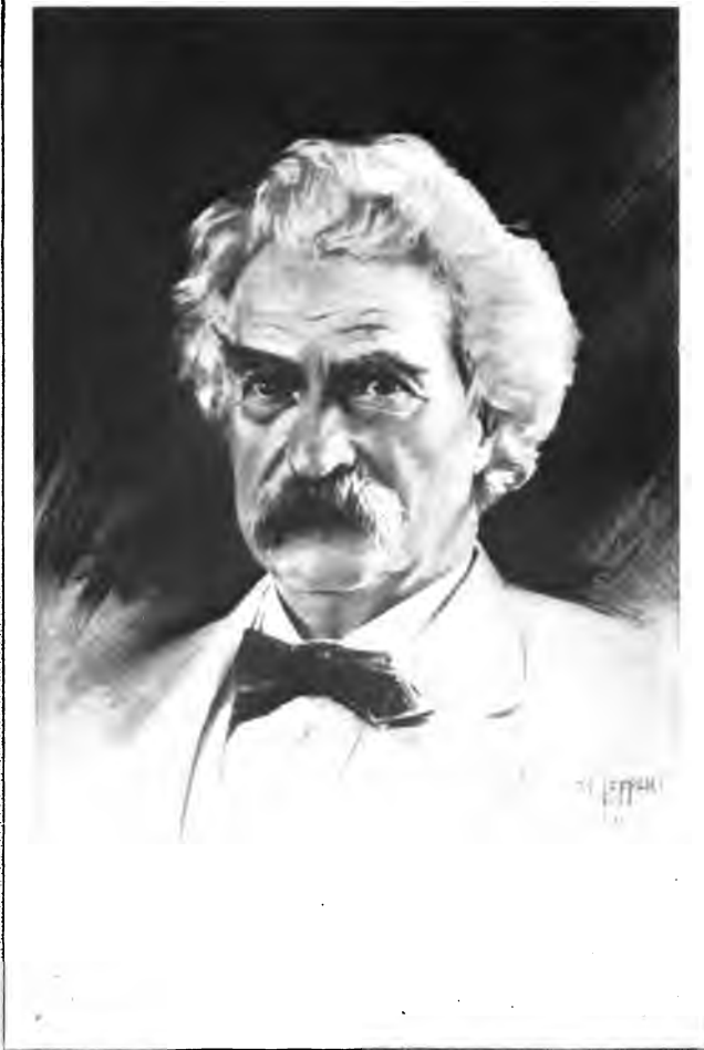
SAMUEL L. CLEMENS (MARK TWAIN)